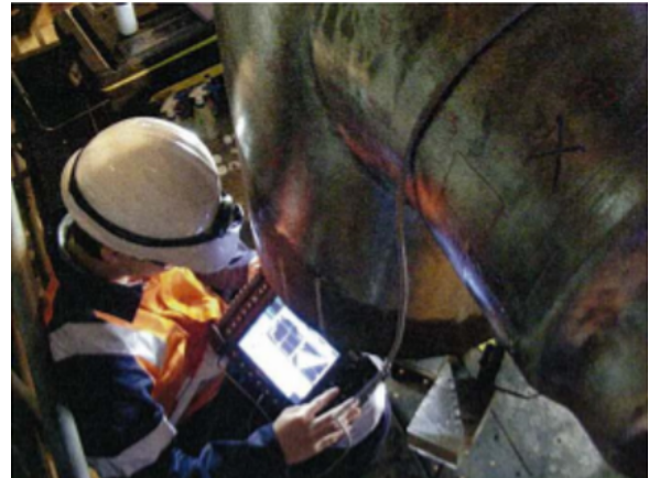
HRL engineer performing phased array ultrasonic testing

HRL engineers can use defect response simulation software to establish the best phased array scan program to optimise coverage, detect minimum-sized defects and reduce false calls.